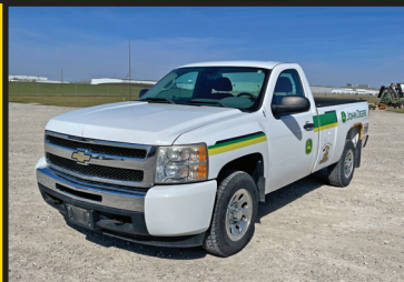
2011 CHEVROLET SILVERADO