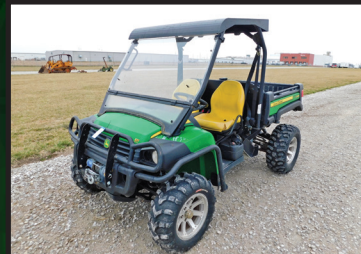
2012 JOHN DEERE 825I XUV