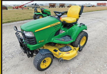
2009 JOHN DEERE X720