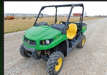
2014 JOHN DEERE XUV 550