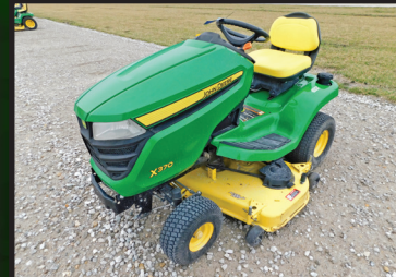
2016 JOHN DEERE X370