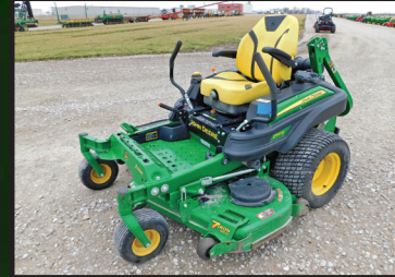
2020 JOHN DEERE Z945M Z-TRAK