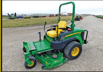
2013 JOHN DEERE 997 Z-TRAK