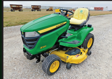
2015 JOHN DEERE X320