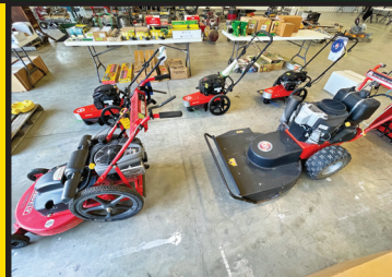
QTY. OF LAWN & GARDEN ITEMS