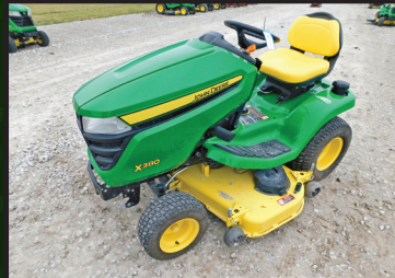
2018 JOHN DEERE X380