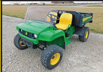
2021 JOHN DEERE TX GATOR