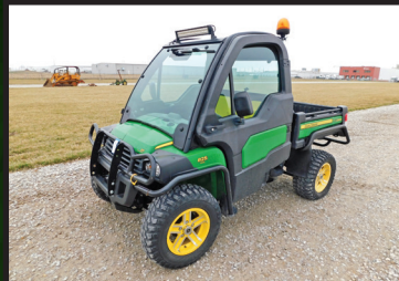
2016 JOHN DEERE 825I XUV