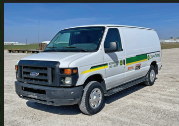
2011 FORD ECONOLINE