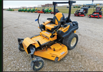
2011 CUB CADET TANK LZ