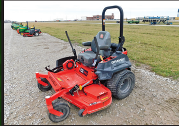
2019 GRAVELY PRO-TURN 460