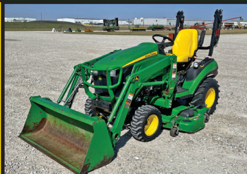
2012 JOHN DEERE 1026R